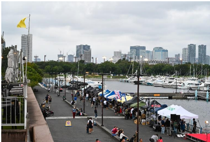
Observation deck, looking out...