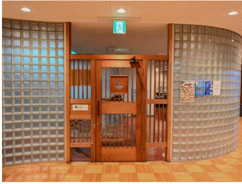
After the exchange of burgees, we were invited to the club's main facility on the second floor.