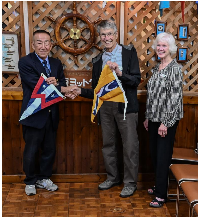
A new friendship begins.