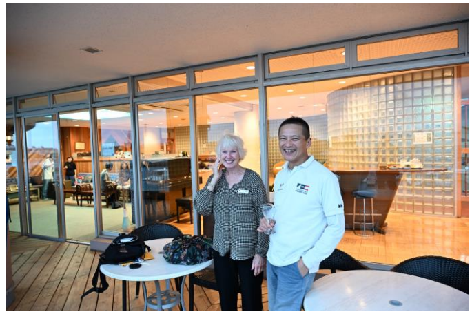
Observation deck, looking in...